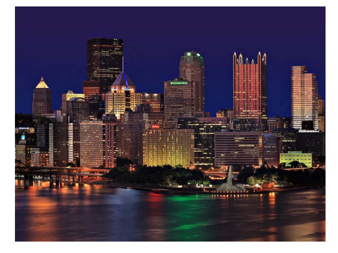
GLAO/MASO Annual Session Hilton Pittsburgh Pittsburgh, Pennsylvania