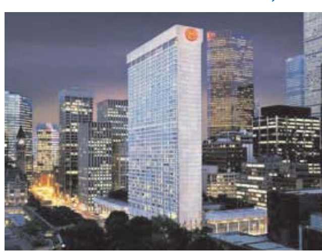
GLAO Annual Session Sheraton Centre Toronto Toronto, ON, Canada