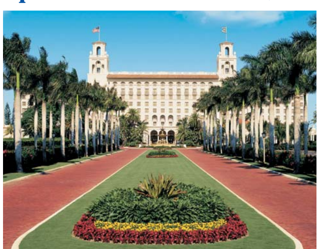
GLAO/MASO Annual Session The Breakers Palm Beach, Florida